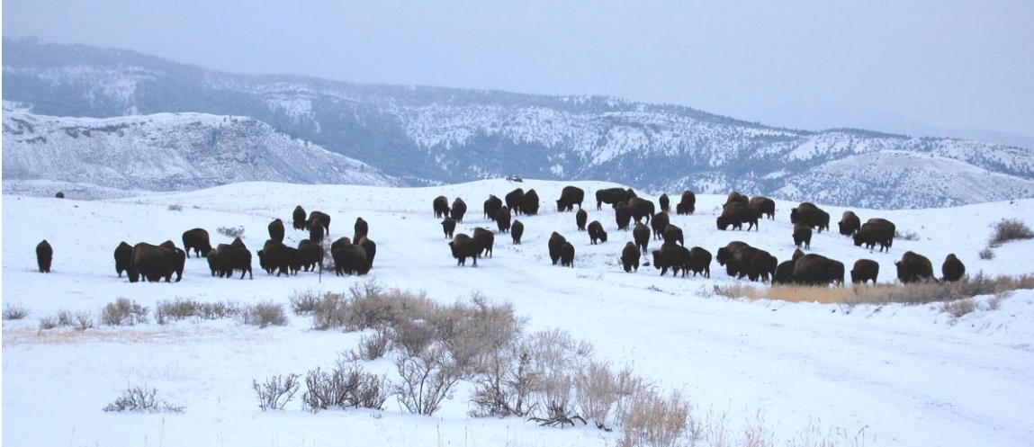
Bison group along Old Yellowstone Trail, Gardiner Basin, Montana, January 2008.

Crucially, grazing by bison can reverse the loss of native grassland species and the disruption of grassland ecosystem structure and function caused by their extirpation (Collins et al. 1998).