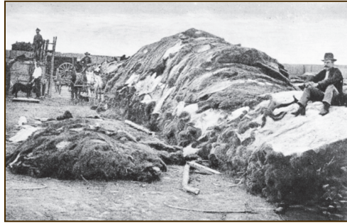
A stack of 40,000 buffalo hides in 1878 shows the enormity of the 19th century slaughter.

The wild buffalo of the Greater Yellowstone Ecosystem (GYE) are the last genetically pure remnant of the great herds of millions that once thundered across the American plains. Descended from just 23 buffalo that survived the 19th century slaughter, they are the only buffalo to continuously occupy their native habitat. Wild and unfenced, this unique population holds the key to the future of wild buffalo in America.