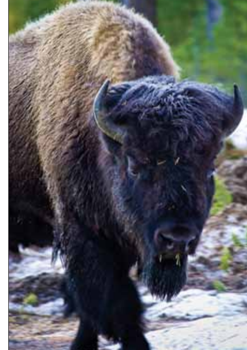
President Obama can help these magnificent wild buffalo - but he needs to hear from you!

Subscribe to BFC's weekly email newsletter. Send your email address to bfc-media@wildrockies.org or visit www.BuffaloFieldCampaign.org more information.