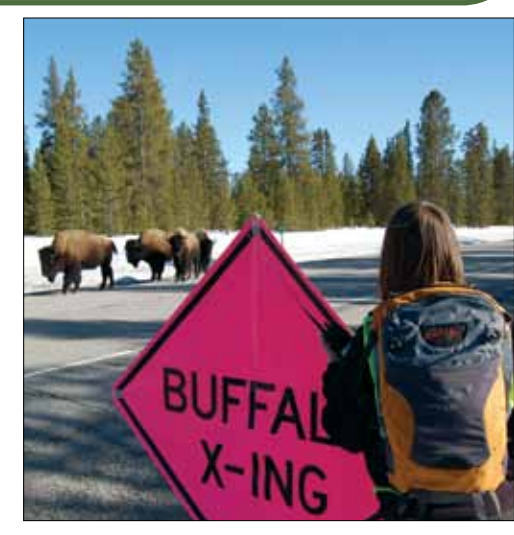
BFC volunteers are in the field daily with the buffalo documenting their harassment and slaughter or alerting motorists on highways that bisect migration corridors.

While today's wild population and on every level of the policy arena numbers more than 3,000, its future is to have it replaced with a plan that threatened by a government plan forced respects the buffalo and their inherent upon state and federal agencies by wildness. Believing that change will Montana's powerful livestock industry. Plan (IBMP), which authorizes hazing, ourselves since 1997 to providing timely shooting, capturing, and slaughtering and accurate information through to keep buffalo confined within the video, still photos, and writing. Our arbitrary borders of Yellowstone National Park, has resulted in the death the field with the buffalo have made of nearly 3,600 buffalo since 2000.