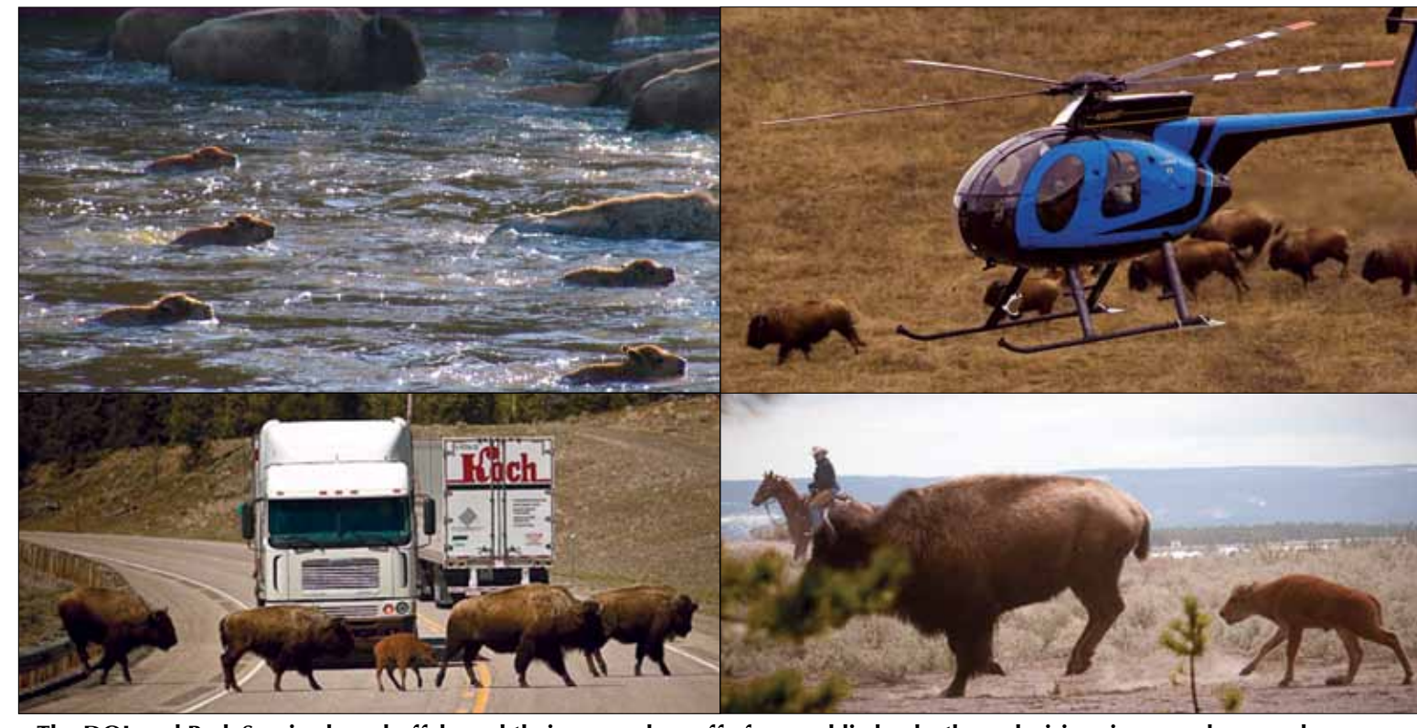
The DOL and Park Service haze buffalo and their new calves off of our public lands, through rising rivers, and across dangerous highways. Bottom right: One calf broke his leg during the haze.

P.O. Box 957, West Yellowstone, MT 59758 • (406) 646-0070 • buffalo@wildrockies.org • www.BuffaloFieldCampaign.org