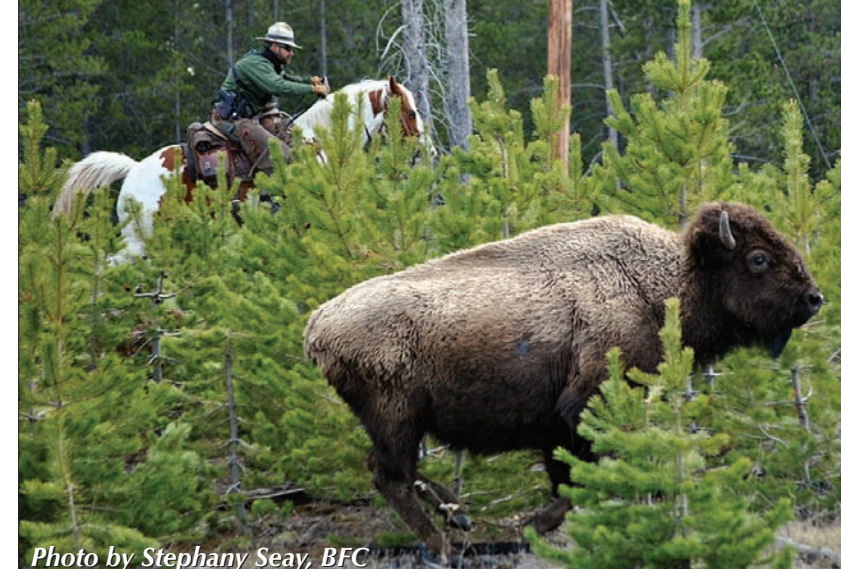
A Park Service rider aggressively chases a pregnant buffalo from Gallatin National Forest lands – these public lands never host any cattle.

Buffalo Field Campaign was founded, in part, to help "strengthen the tribal voice in management decisions affecting the Yellowstone herd." We have always advocated for the inclusion of First Nations at the decisionmaking table. In 2010 the Nez Perce and Confederated Salish and Kootenai tribes, along with the InterTribal Buffalo Council, were made voting buffalo and government agents spent as the connection between wild bison partners of the plan that dictates the weeks aggressively hazing hundreds and their habitat is severed by human buffalo's fate. Their combined voices more from habitat on the Gallatin have served to remind the agencies of National Forest, but not a single will be here. With your support we will the plan's commitment, long ignored, buffalo was slaughtered. In a major remain a strong force on the ground.