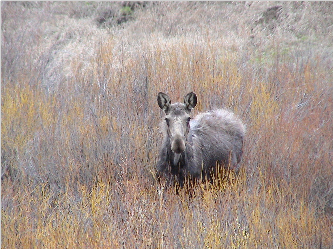
Moose in willow bottom of Wapiti Creek May 2005

The most significant issue aside from competition with other wintering wildlife is the influence wild bison may have on riparian and aspen complexes in the area in relation to spring and summer grizzly bear foods. The Taylor Fork is used heavily by grizzly bear, especially in spring and early summer. Grizzly bear key in on forage opportunities associated with these mesic areas. Increased grazing pressure from bison may have a negative impact on vegetation in these critical habitats. Contrastly, the addition of bison adds another source of carrion and prey to the system. This additional source of protein may benefit predators like grizzly bear, wolves, mountain lions and coyotes.