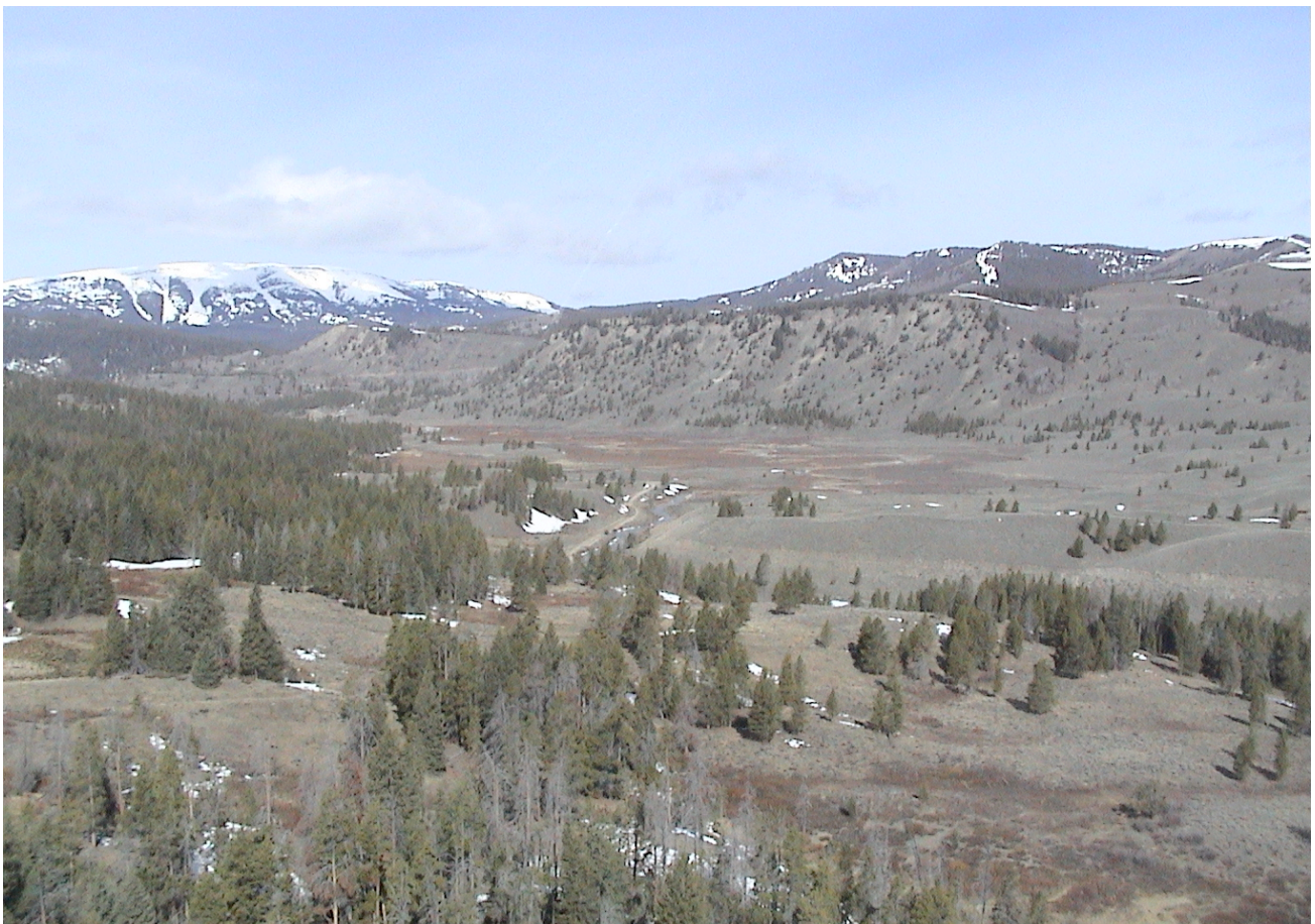
Taylor Fork – Looking northwest, toward Shed Horn Mountain and Cache Creek