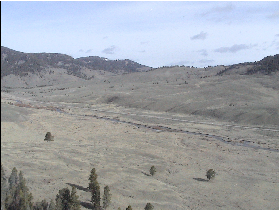
A northeast view from Lodgepole Creek. Highway 191 and Tepee Creek in the background.

During mild winters, the majority of those elk occupy the Cache Creek and Albino Lake areas within the Taylor Fork drainage. During more severe winter conditions, many of the elk wintering in the Cache Creek vicinity move toward winter ranges in the Madison Valley. The majority of elk wintering in the Taylor Fork area under these conditions concentrate in the Cameron Draw-Lincoln Mountain area. Smaller groups of elk winter in the Wapiti and Eldridge Creek areas. The severity of winter conditions influence the movement of elk out of the Taylor Fork toward winter ranges in the Madison Valley. The timing of this movement explains some of the conditions that cause significant variations in the number of elk observed during the early winter aerial surveys.