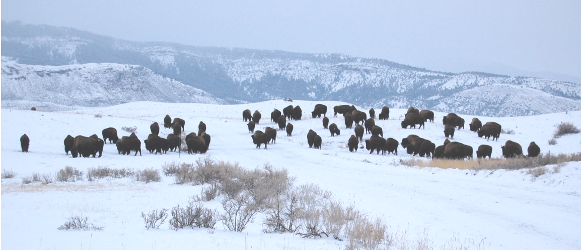
Bison group along Old Yellowstone Trail, Gardiner Basin, Montana, January 2008.

Crucially, grazing by bison can reverse the loss of native grassland species and the disruption of grassland ecosystem structure and function caused by their extirpation (Collins et al. 1998).