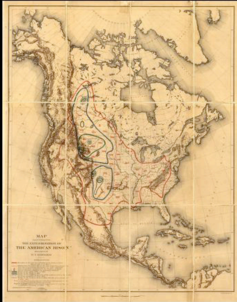
Historic bison range map from William T. Hornaday, The Extermination of the American Bison , 1889.